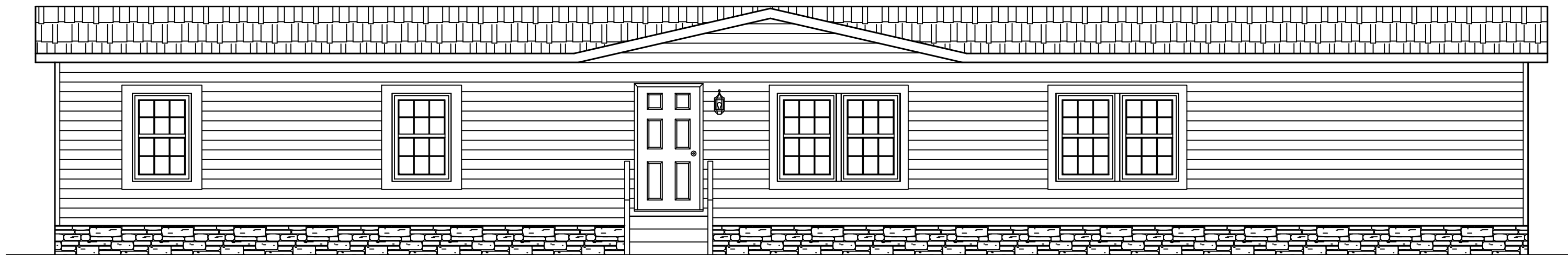
76'-0" FRONT ELEVATION