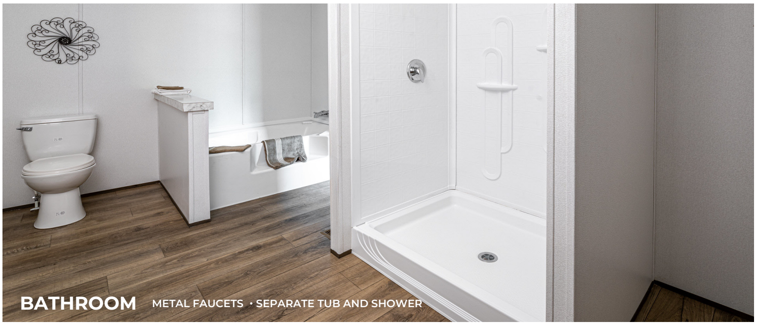
BATHROOM METAL FAUCETS • SEPARATE TUB AND SHOWER