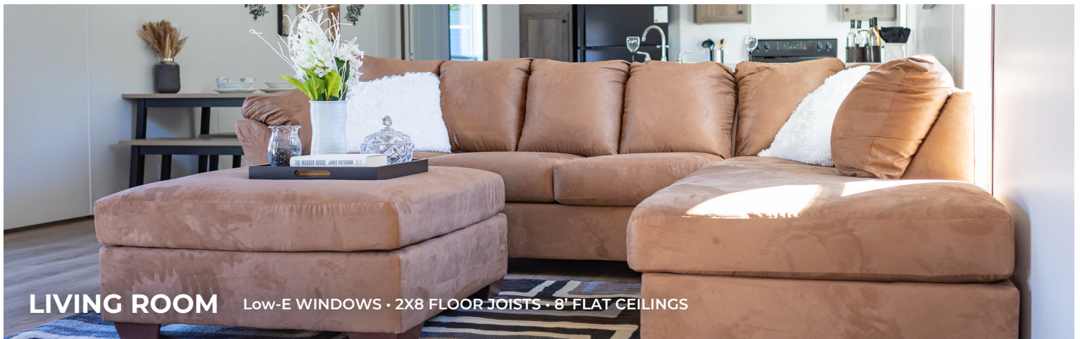
LIVING ROOM Low-E WINDOWS • 2X8 FLOOR JOISTS • 8' FLAT CEILINGS